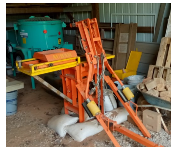
The Aurum 3000 Brick Machine